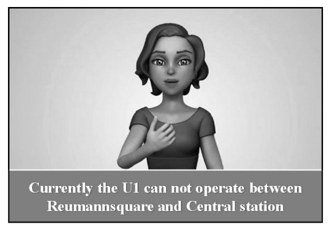
Fig. 3. Video avatar (according to [22])

This means that the user can configure structured incident messages with less complex syntax and a controlled vocabulary. This does not only facilitate the subsequent automatic translation process, but also facilitates understanding of text messages to all other (hearing) passengers. Once the structured incident message is available a video with a sign language avatar will be automatically rendered and stored into a database. The Intermodal Transport Information System (ITIS) determines the affected passengers and distributes to the smart phone of the deaf or hard of hearing passenger with a push service. Once the passenger has been advised of a service disruption along his route, he or she can click on a link and see the incident notification which is shown to him with a digital avatar. An example of an incident notification in sign language of the public transport operator of the city of Vienna (Austria) is shown in Fig. 3.