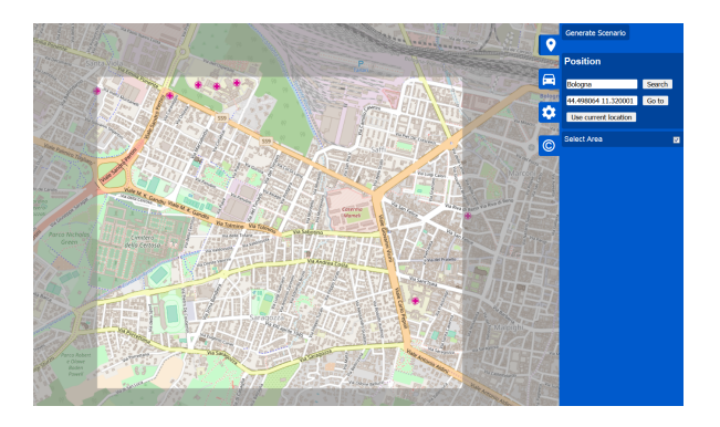
Fig. 1. Street Network of the Real-World Bologna Scenario in SUMO's WebWizard