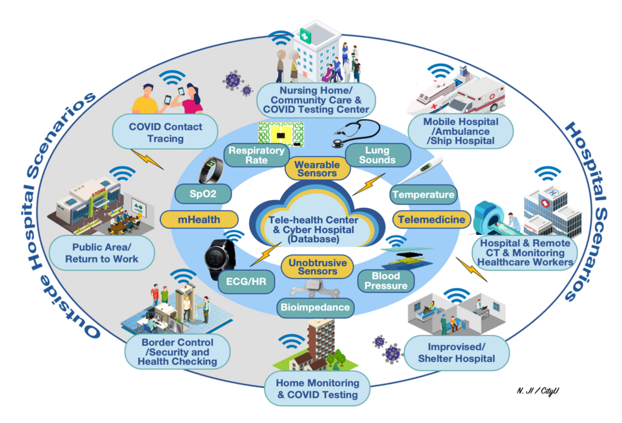
Fig. 1. Application scenarios for wearable sensors during pandemics [3], [4].

with molecular testing related to the COVID-19 and/or acute CVD symptoms in real world scenarios (see Fig. 1) [3], [4], has a huge potential to address this challenge and are expected to be better integrated in the inside/outside hospital workflow [5]. However, wearable sensors and mHealth have not been fully utilized in pandemic control to date. In this work, specific application scenarios encompassing the use of wearable sensors and mHealth in closed-loop management of acute CVD patients during the COVID pandemic are proposed. This could help to triage patients before hospitalization and provide opportunities to remotely monitor the health status of both patients and caregivers so as to limit virus spread and avoid cross-infections while assisting to provide emergency services timely to acute CVD patients.