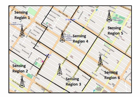
Fig. 2. A region of Montreal city (3000 X 3000 meter<sup>2</sup>)

query distance. Unlike Fig. 3 (a), the high rate of changes in access time is due to the fact that hop count increases with the increase in query distance. SOTIS has suffered the worst delay as it involves redundant message exchanges. VSFSC achieves the smallest access time since the latest data stored in RSU is provided to the consumer in no-time. The server setup time of VITP has a big role in the total access time; therefore, VITP performs worse than VSFSC. Information accuracy is shown in Fig. 3(c). For all three schemes, VSFSC, VITP and SOTIS, the accuracy decreases with the increase of vehicle density. Indeed, the higher the number of vehicles, the larger is the bandwidth required to send individual speed. Thus, with the increase in density, packet collisions increase. As a result, the average speed is computed by insufficient information. It is noticed that the impact of vehicle density on information accuracy is lowest in case of VSFSC. This can be explained by the fact that each vehicle uses unicast rather than broadcast to send the sensed data to the home-RSU. On the contrary, SOTIS and VITP use broadcast which is highly unreliable in high density scenarios.