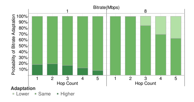
Fig. 1. Likelihood of bitrate adaptation with cache hop distance.

during downloads of the most recent segments. The bitrate of subsequent requests is selected by the consumer accordingly.