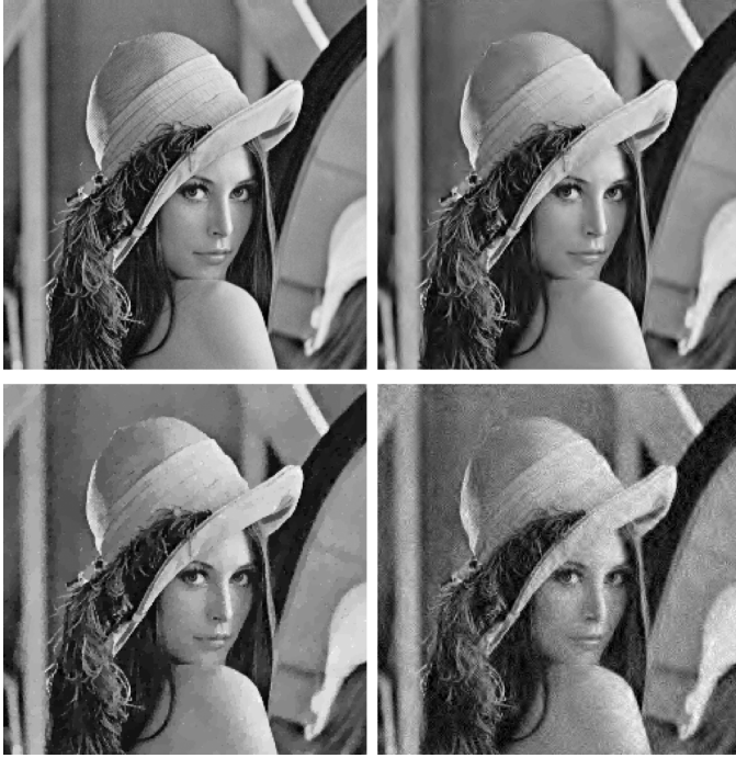
Fig. 2. Reconstruction example for Lena in spread spectrum acquisition setting ( M = 0.2N , \text{ISNR} = 30 dB). From left to right and top to bottom: original image, reconstructed images for SARA (28.1 dB), RW-TV (26.3 dB) and BPD88 (21.4 dB).