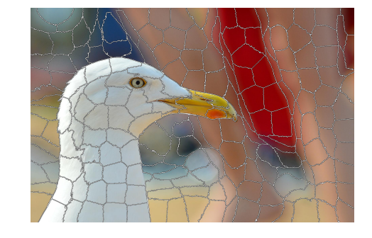
Fig. 1. A sample image with superpixels.

Accordingly, when a light source illumination signal in 100 Hz is sampled with 29.97 fps camera, the base alias frequency of ENF is obtained as 10.09 Hz.