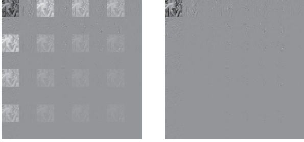
Fig. 3. Barbara transformed with 8 \times 8 (left) DST and (right) R-FST.

According to Section III-A, a 4 \times 4 regularity constraint matrix \tilde{\mathbf{R}}^{[4]} is constructed from only a rotation matrix \hat{\Theta}_{(0,2)}^{(1)} . Consequently, \hat{\mathbf{S}}^{[4]} is as follows: