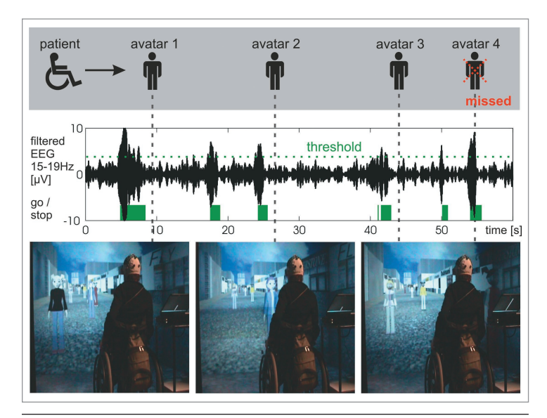
Figure 2. Simulation of wheelchair control in a VE for a tetraplegic patient using foot motor imagery. The subject must "walk" down the virtual street using motor imagery, stopping in front of some avatars for a discussion.