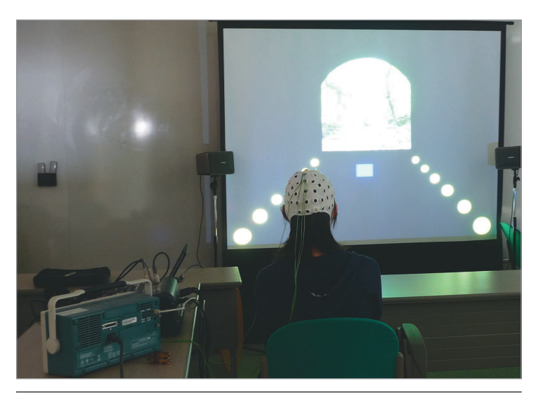
Figure 3. Monitoring drivers' alertness level in a virtual reality driving simulation using BCI and P300 signals.

again toward the next avatar, until he finally reached the end of the street. Over two days, the tetraplegic participant performed 10 runs of this experiment and could stop by 90 percent of the 15 avatars and talk with them. In four runs, he achieved a performance of 100 percent. These results demonstrate for the first time that a tetraplegic person, sitting in a wheelchair, could control his movements in a VE by using an asynchronous BCI based on one single EEG electrode.