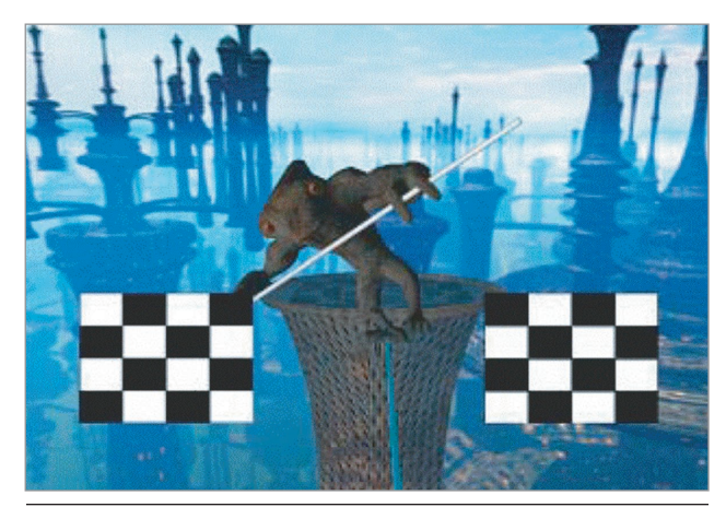
Figure 1. The MindBalance videogame. The player must control the balance of a virtual character walking a tightrope by applying visual attention to two flickering checkerboards.

When playing the game, the user must control the animated character, which is walking a tightrope while being subjected to random movements to the left and right. If the user does not accurately attend to the correct side to control the character after initially losing balance (first degree), the character will move to a more precarious (second degree) state of instability, then, progressively, to an unrecoverable state (third degree), at which point the character falls.