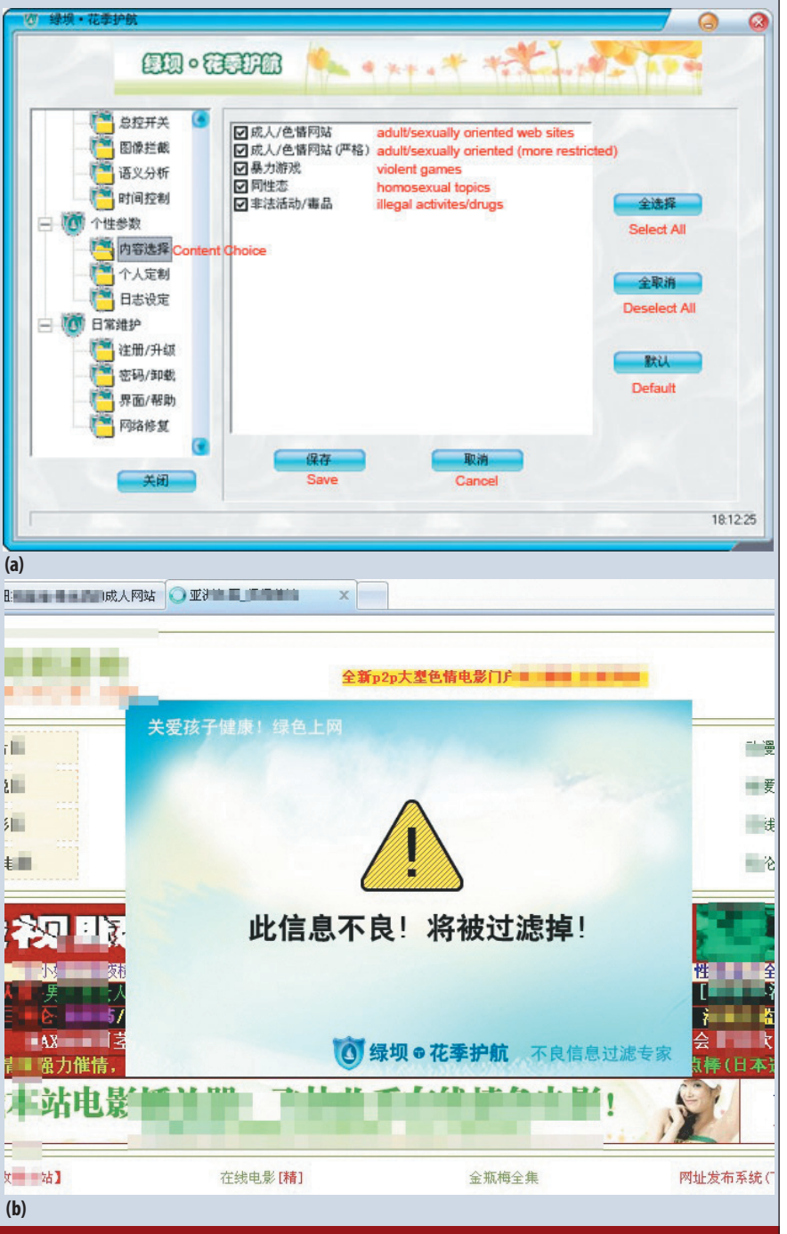
Figure 1. Green Dam Web filter. (a) Users or network administrators can choose to block or admit access to five categories of Web content. (b) Green Dam's image scanner relies on skin color and face recognition to block access to pornographic websites.

However, a content filter has two difficult and somewhat com-