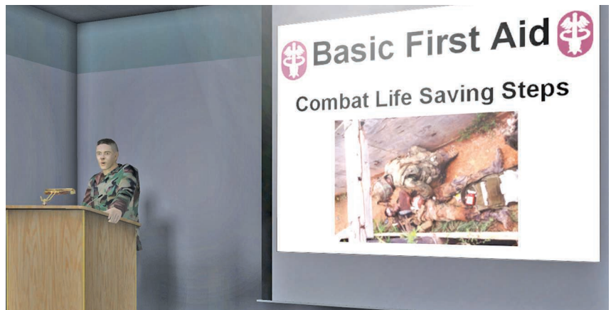
FIGURE 2. America's Army instructor teaching basic combat lifesaving.