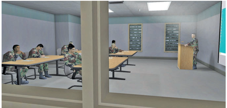
FIGURE 1. America's Army basic combat lifesaving class.

I knew well and asked if he could come to this workshop. He immediately said that he would first have to chat with EA's attorneys! Wow! Just to come to a