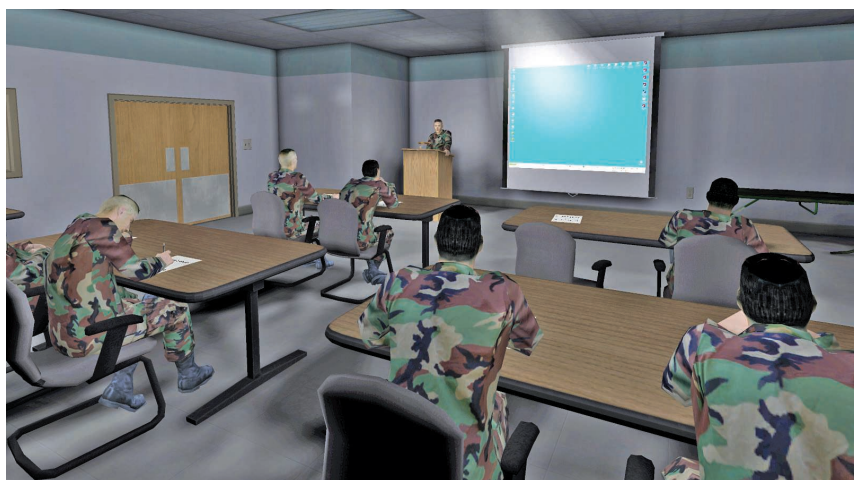
FIGURE 3. America's Army soldiers taking the in-game test.