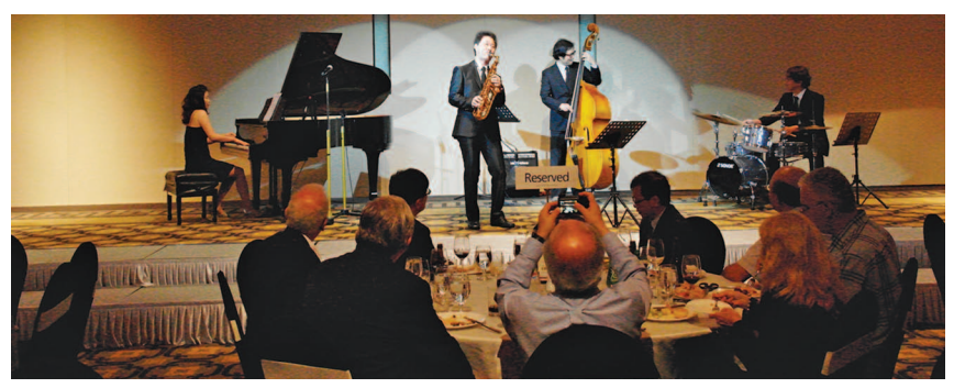
Attendees at the banquet of ISCE 2014 enjoy the fusion jazz performance.