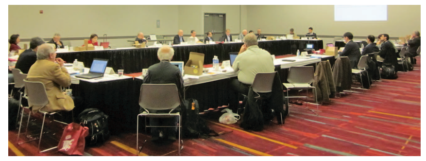
FIGURE 3. The 2014 CE Society BoG meeting.

If you have ever wondered what a Board of Governors (BoG) meeting looks like, well here it is, shown in Figure 3. Not hugely inspiring—I'll bet you didn't realize how big the Society Board is, but there are a lot of things