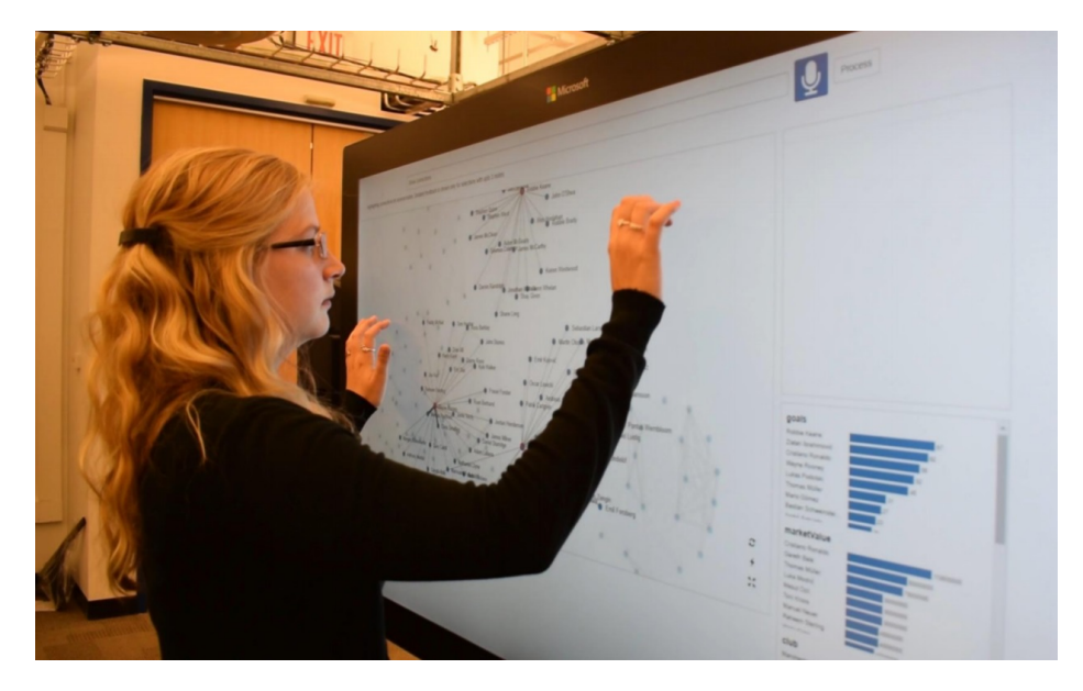
Figure 4. Orko is a network visualization tool that facilitates multimodal interaction by combining natural language (with speech) and direct manipulation (with touch) [15].

The "Multimodal Interaction for Data Visualization" workshop at AVI 2018 [3] (multimodalvis.github.io) is the initial attempt to build a community of multimodal visualization researchers and establish an agenda for research on multimodal interactions for and with visualization. We call for follow-up efforts from the visualization research community to advance this topic, investigating important and interesting research questions.