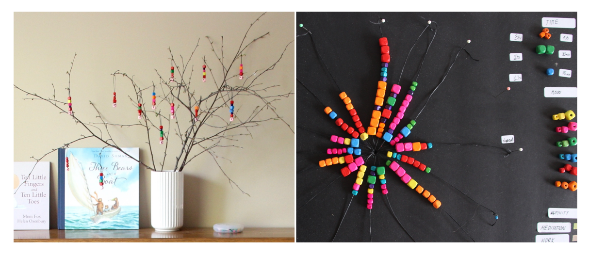
Figure 1. Examples of data physicalization with personal data [5] (Courtesy of Alice Thudt). (Left) A bead ornament daily to decorate branches with 4-hour interval represented by one bead with size showing her mood and colour showing whether she was active, social, or home. (Right) a participant's six different activities (e.g., meditation, work) with different coloured beads, each representing one hour, with their size showing enjoyment.

lowing this workshop, however, only a limited number of researchers have continued to work at the intersection of visualization and personal informatics (e.g., data physicalization shown in Figure 1 [5], research methods in personal visualization [6]). We call for further efforts and contributions to empower the general public while addressing meaningful visualization challenges.