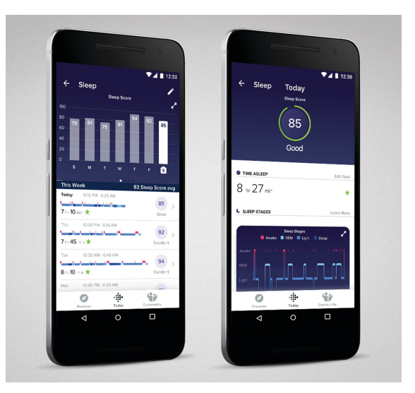
Figure 2. The Fitbit mobile app shows daily sleep scores with a standard bar chart (left) while displaying different sleep stages with a custom chart (right).

The difficulties of designing visualizations for mobile, however, are not only related to the interaction concept. Mobile devices these days often have very high-resolution displays but the limited physical size requires rethinking minimal sizes for the display of data points and reference structures (e.g., grids, labels, tickmarks). Scalability regarding smaller rather than larger display sizes becomes a problem for mobile visualizations and we need more perceptual studies to understand