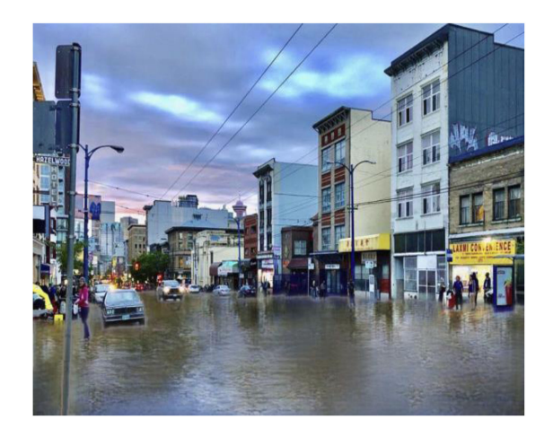
FIGURE 1. Example of an urban flooding scene generated by our generative model.

Research in behavioral science has systematically shown that people's behaviors and attitudes can be affected by interactions with images that visually depict the future consequences of actions taken today. For instance, researchers have found that young people tend to save significantly more money when presented with a decision calculator that projects their pension amount, accompanied with an age-progressed photograph of themselves at retirement age.<sup>12</sup> Likewise, middle-aged and older employees commit to putting aside more money for their retirement when the total amount is made more vivid and concrete, as a monthly amount to live on, with concrete examples of the objects that they can and cannot purchase.<sup>10</sup>