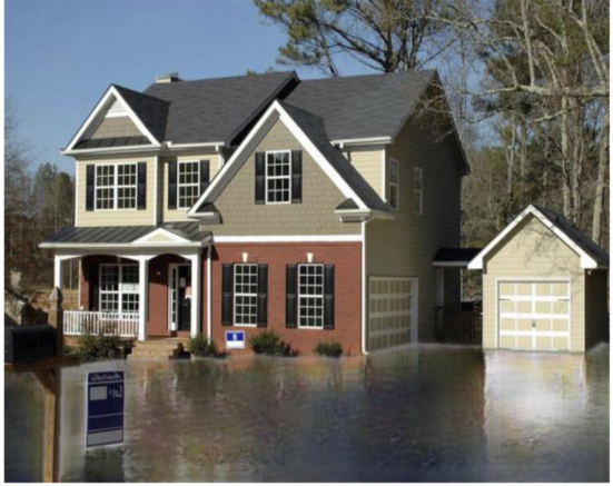
FIGURE 2. Before and after example of the transformation carried out by our GAN approach, based on an image of a suburban house.

away in time and space. For example, MIT's Deep Empathy project aims to use AI-generated imagery simulating the impacts of war on major global cities like Boston and Paris in order to help viewers empathize with victims of war in places like Syria and Afghanistan. Nonetheless, research on the psychological and emotional impact of AI-generated imagery is limited, and warrants further empirical studies regarding the ways in which they can impact human perception and decision-making, while addressing the specific moral and technical challenges raised by the creation and usage of AI-generated images.<sup>16</sup>