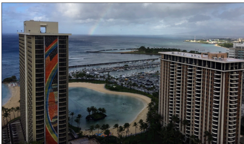
IEEE SSCI 2017 participants were treated to a beautiful rainbow to start the conference at the Hilton Hawaiian Village Resort.

In all, there were more than 30 symposia, with many featuring keynote speakers and special sessions. In addition, free tutorials were presented across all the main areas of computational intelligence, including neural networks, fuzzy logic, evolutionary computation, swarm