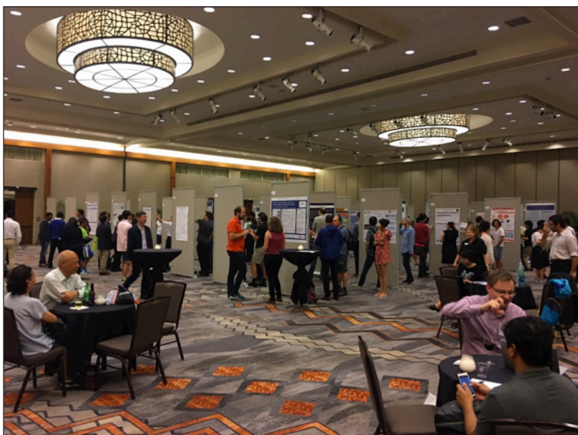
The poster session included approximately 80 papers across all 30+ symposia.