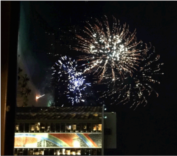
Friday night fireworks concluded the IEEE SSCI 2017 event.