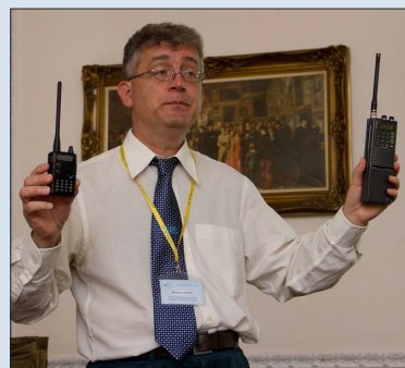
Displaying older and modern radio electronics at International conference of Computer Networks, CN2017.