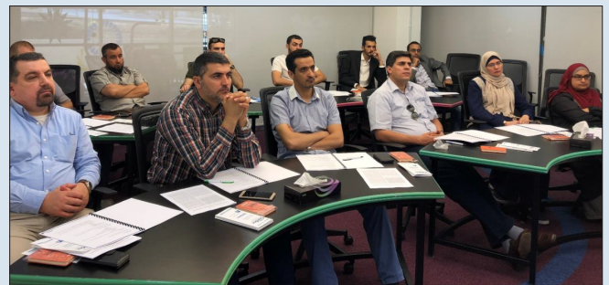
Wireless for IoT course.

schedules. However, we are working with the IEEE young professionals to find effective ways to connect with them. In the end, engagement with members with different backgrounds is what enriches IEEE ComSoc.