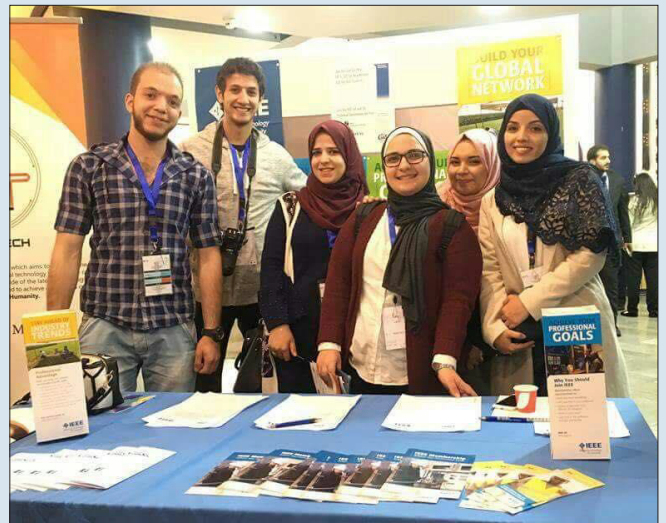
Grand Tech booth.

Finally, we are considering methods to connect with professionals, the last group of our member base. Unfortunately, it seems to be difficult to reach out to them due to their busy