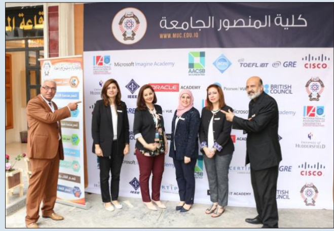
Academic women in "AL-Mansour College University" have a great volunteering efforts to support and enhance the realization of success of the International conference hold in Nov. 2018. This group of Iraqi Women gave good indication to the Interest of IEEE Iraq Section with the Women in engineering and Science inside Iraqi Scientific Area.

One of the important points that needs to be mentioned here is that within the Conference of Zakho University and Duhook Poly-technique University, papers from 11 countries were submitted in addition to the papers submitted from Iraq. This is the first time that this many countries participated in an international conference held in Iraq.