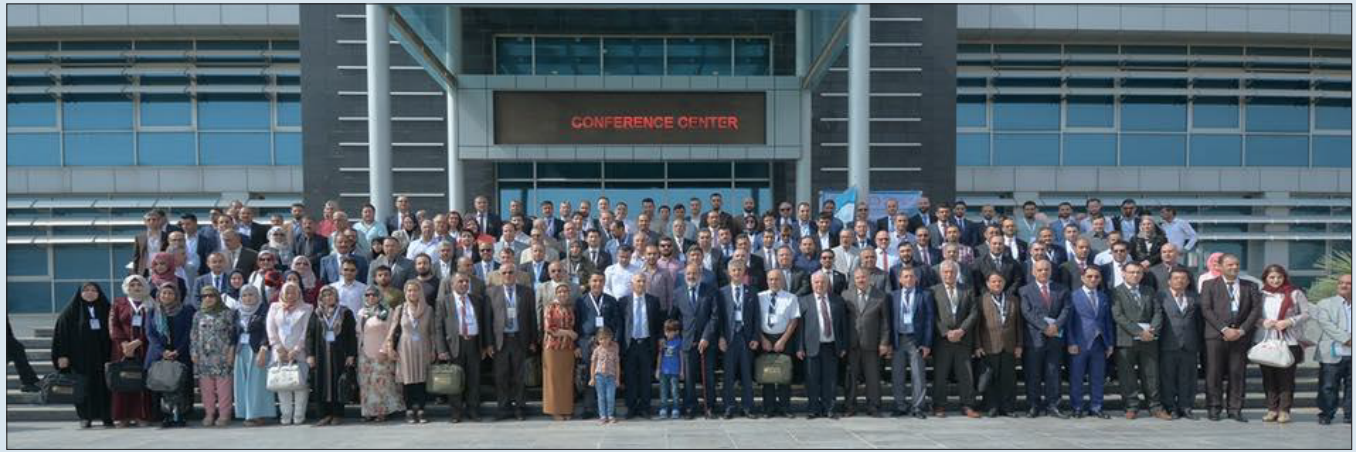
Some of the participants in the Zacho and Duhook Poly-Technique University Conference held on 9-11 Oct. 2018.