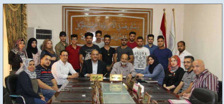
Signing the Local MoU for the supporting the "Al-Sadiq University" to hold the 3rd International conference sponsored technically by IEEE. For the first time some of the best undergraduate students were invited to participate in such event in the presidency of the university.