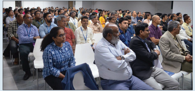
The attendance of the event was impressive.

Now, we all love each other so much in the Bangalore chapter that we just want to meet each other more often than the 5G Summits and the boring regular chapter team meetings would permit. So we started a Study Group starting with a cool topic on “Massive MIMO”. These study group discussions have been informal in nature, and inevitably everyone’s ignorance