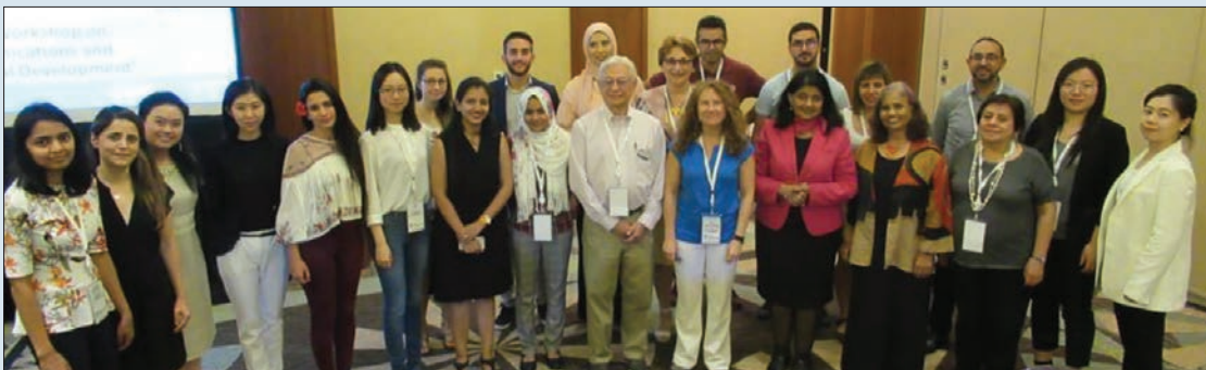
Afternoon group picture.