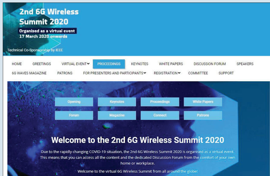
Welcome webpage for the registered attendees.