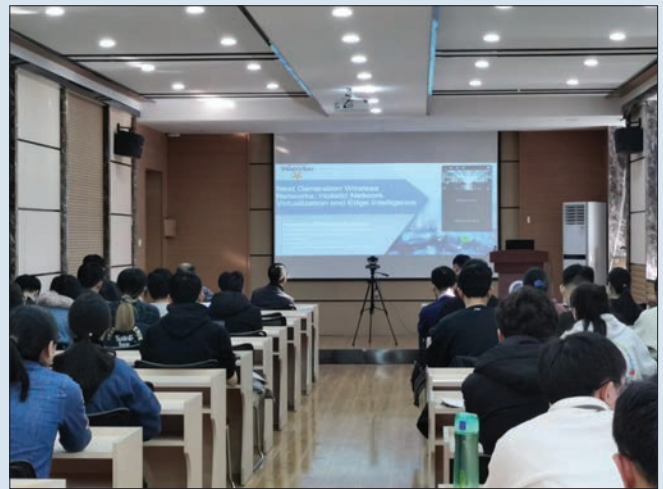
Photo of online-offline experts and students.