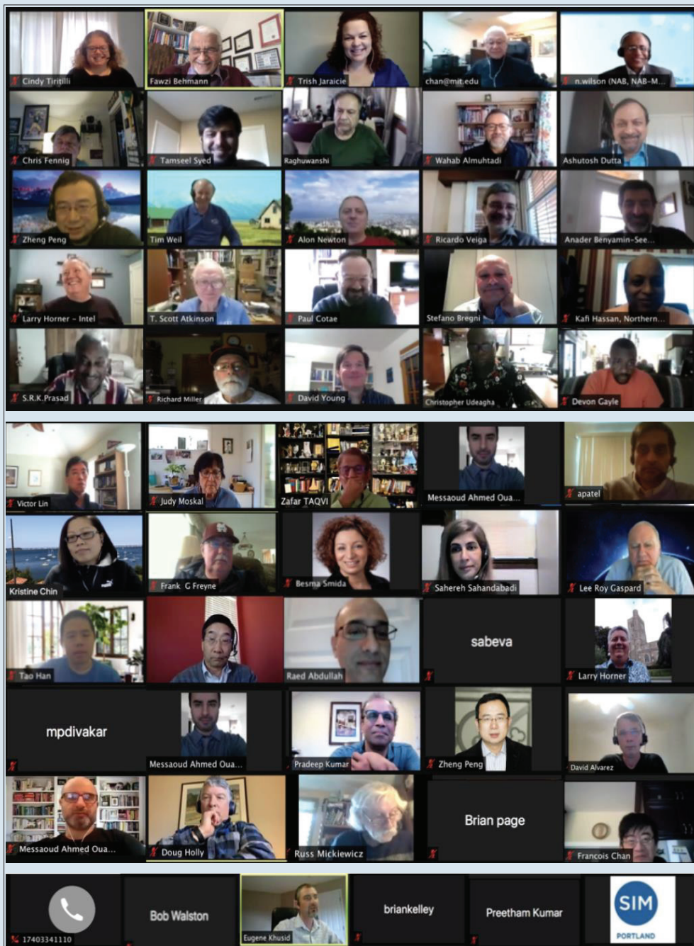
Participants at NAB RCCC 2020 December 5 and 6.