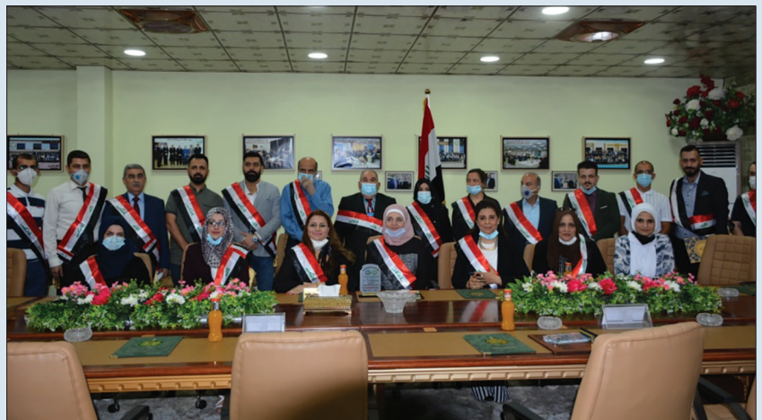
The volunteer team of organizers of IT-ELA 2020 from the IEEE ComSoc Iraq Chapter