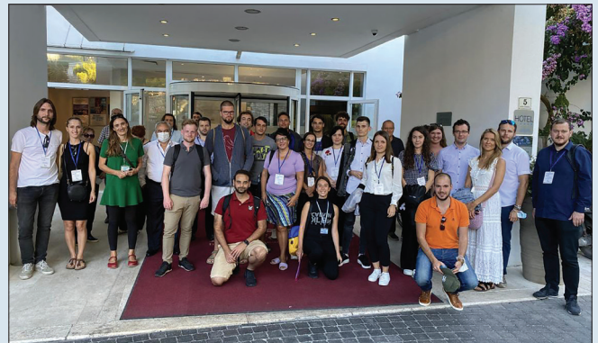
Gathering for the walking tour towards the City of Hvar fortress from the 16th century.