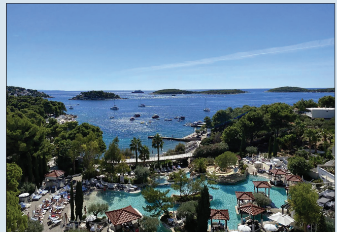
The SoftCOM 2021 conference has been held in attractive ambience of the Amfora Hvar Grand Beach Resort at the island of Hvar, Croatia