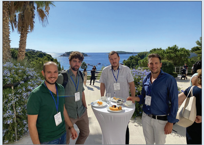
Chatting during the coffee break in attractive ambience of the Amfora Hvar Grand Beach Resort at the island of Hvar, Croatia