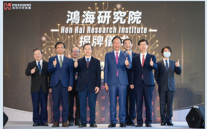
Inauguration ceremony for Foxconn's Hon Hai Research Institute on Jan. 4, 2021. Fourth from the right is Terry Gou, the founder of Foxconn.