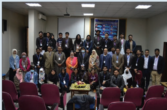
Group Photo taken at the end of the workshop with guest of honour, guest speakers, workshop coordinators, organizers, volunteers, and participants