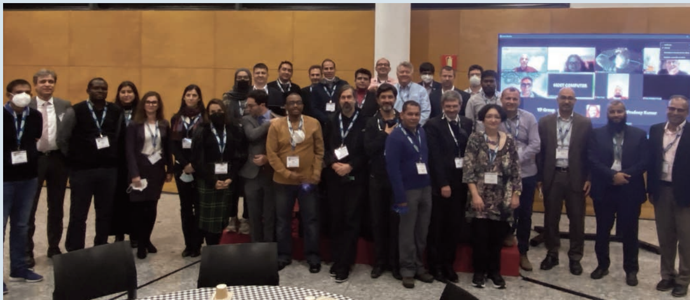
40+ members of the Membership Value Research Congress joined together in Madrid to outline new product plans and services to bring to our ComSoc community.