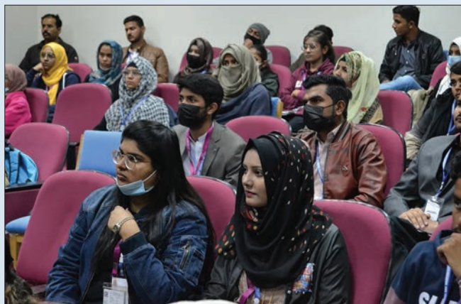
Participants attending the EGD workshop