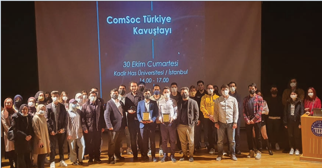
Attendees of Comsoc Kavustay