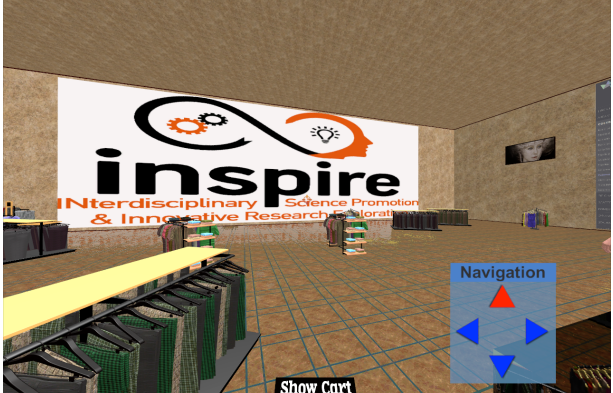
Fig. 2. The SmartVR prototype: (left) Select mode, (right) Navigation

transceiver; and (v) an Oculus Rift Development Kit 2 (DK2) headset. The headset and the monitor will be attached to the VR workstation to allow visitors to view the visual output of the application both in 2D and 3D. The Bluetooth transceiver is used to allow communication between the VR workstation and the wearable device. We chose to use the Microsoft Band 2 wearable device as it features multiple embedded sensors such as 3-axis accelerometer, 3-axis gyroscope, UV and heart rate sensors, which we leverage to recognize a variety of gestures. In addition, Microsoft Band 2 operates a proprietary operating system with built-in support for interoperability with different programming languages such as C#, Java, or Swift.