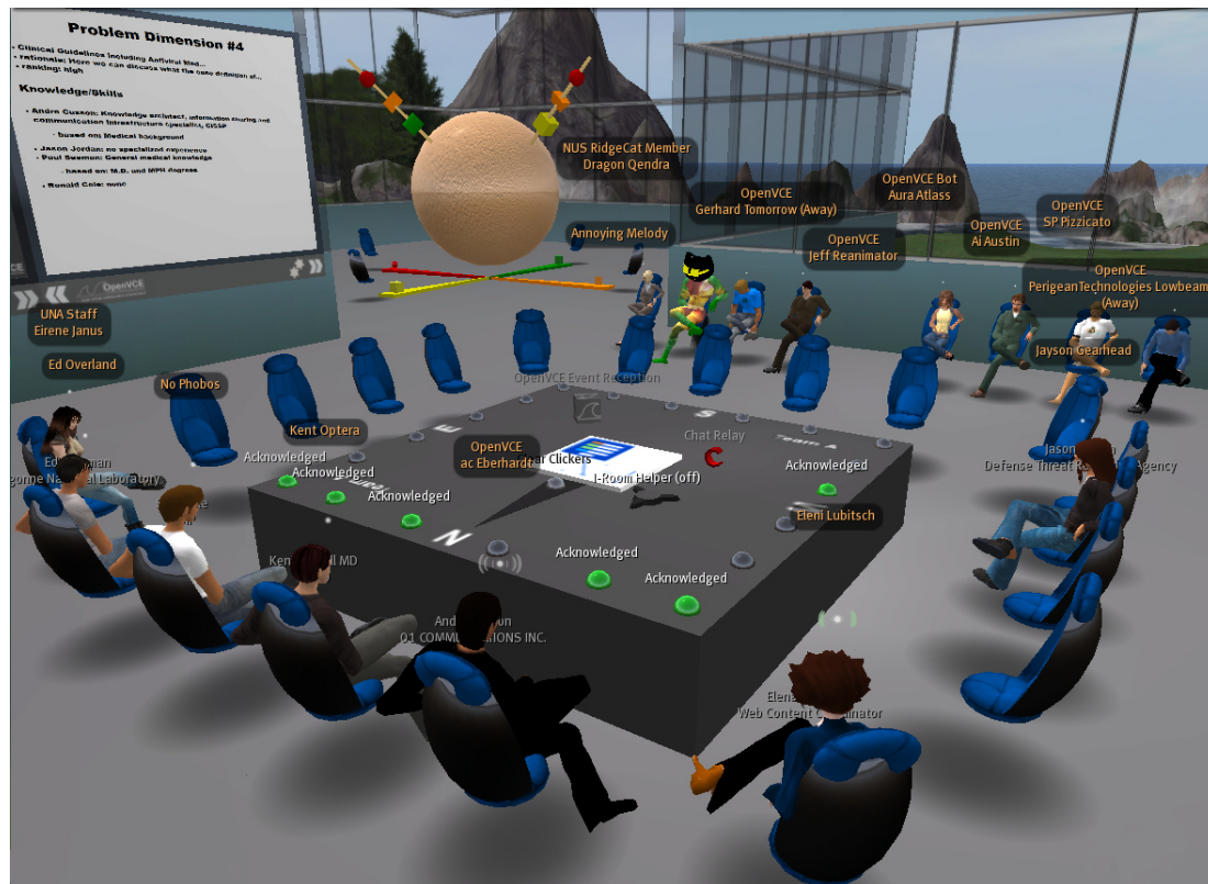
Figure 1. I-Room showing live information feeds and links to external data sources.

Beyond the advantages a shared interaction space confers, the I-Room can help deliver intelligent systems support for meetings and collaborative activities. In particular, we designed the I-Room to draw on I-X Technology, 1 which provides human participants with intelligent and intelligible task support, process management, collaborative tools, and planning aids. The I-Room can also utilize a range of manual and automated capabilities or agents in a coherent way. Participants share meaningful information about the processes or products they're working on through a common conceptual model called <I-N-C-A> (Issues-Nodes-Constraints-Annotations). 2 The I-Room framework is flexible enough to provide participants in I-Room meetings with access to knowledge-based content and natural-language-generation technology that tailors utterances to users' specific experience levels.