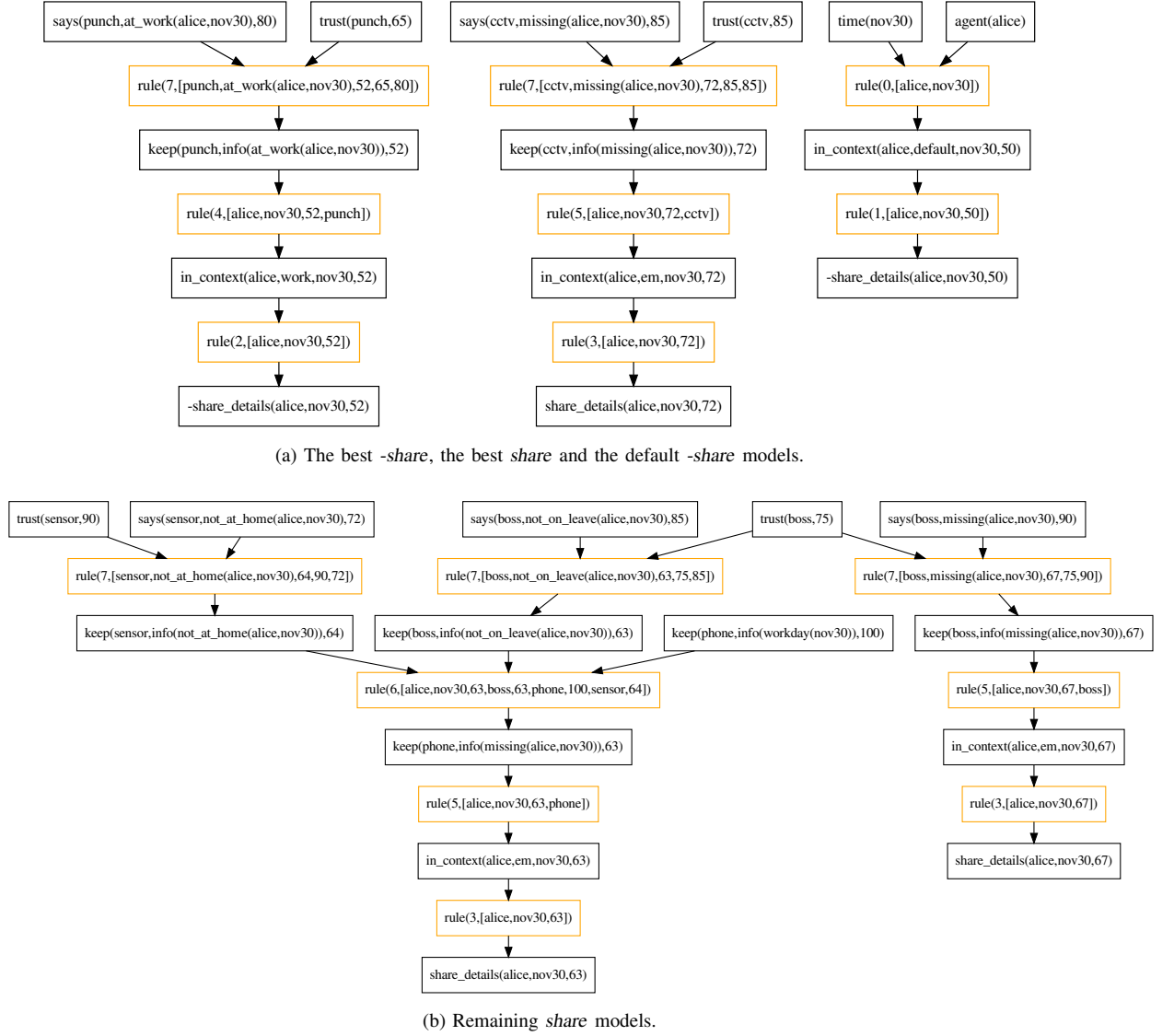
Figure 1: All the models generated by the phone agent. The rules are depicted as orange boxes, while all other predicates are depicted as black boxes. An arrow from a black box to an orange box shows inputs to a rule, and an arrow from an orange box to a black box means that the rule was applied to conclude the target predicate.

that appears in two models: m(bs) and m(b) (Figure 1b). The minimum trust value is the one computed in m(b) , the trust value of boss is updated as 48.