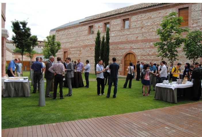
Workshop coffee break at the Hotel Parador de Alcalá de Henares

The 2012 IEEE Intelligent Vehicles Symposium Workshops took place on 3 rd of June 2012 in Alcalá de Henares (Madrid), Spain, at the Hotel Parador de Alcalá de Henares. Six workshops were offered to the audience and 120 researchers from the entire world attended the Workshops day. The authors of the papers with the best reviews were invited to this special issue, agreed by the EiC of the IEEE ITS Magazine, the IV2012 General and Workshop Chairs and each Workshop Organizer.