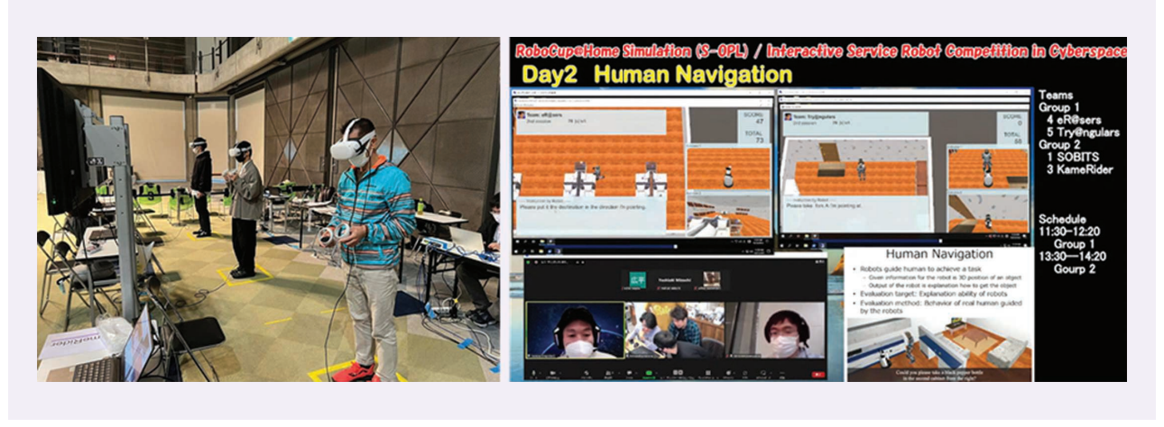
FIGURE 4. The Robot Competition held at IROS 2022 in Kyoto (the Interactive Server Robot Competition in Cyberspace). Humans can interact with virtual robots in cyberspace via an immersive virtual reality interface. The evaluation target is the ability of explainable AI in a daily life environment.

ment and seamless and meaningful exchanges between humans and robots. Second, significant progress in integrating machine learning techniques with model-based approaches in cognitive robots is being made. This amalgamation can lead to enhanced perception, decision making, and learning capabilities, empowering robots to adapt and respond intelligently to dynamic environments. Finally, there has been notable headway in language understanding and acquisition within real-world settings. Cognitive