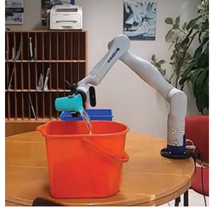
FIGURE 2. The robot understands the object's physical properties and selects the most appropriate kinematics and manipulation action. Details are provided in [5].

TC-CoRo is currently cochaired by five researchers and three emeritus cochairs from different regions of the world, genders, and seniorities. The committee members engage in invited talks, journal editorial boards, and conference program committees to promote cognitive robotics and strengthen the community.