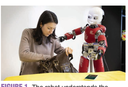
FIGURE 1. The robot understands the need of the human partner (i.e., finding her ringing mobile phone), anticipates her request for help, and selects the most appropriate way to support her by using intuitive communication to direct her attention to the desired object.

Digital Object Identifier 10.1109/MRA.2023.3293303 Date of current version: 11 September 2023