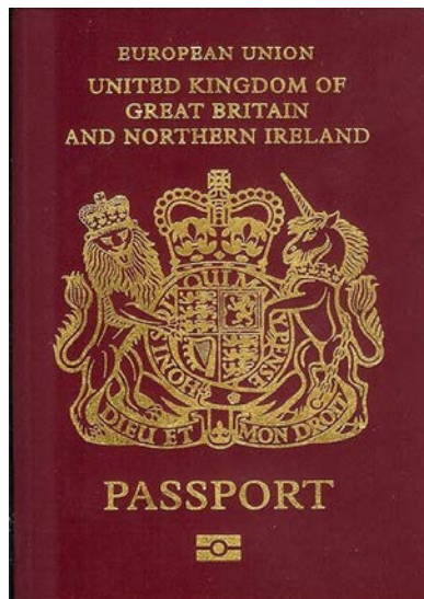
Figure 3: Biometric passports are being widely adopted throughout the EU

All countries carefully monitor the identity of individuals passing through their borders. These checks identify suspected security threats and help prevent illegal immigration. Biometrics technology offers a means to automate this process as well as potentially increasing the accuracy of identifying those claiming a false identity.