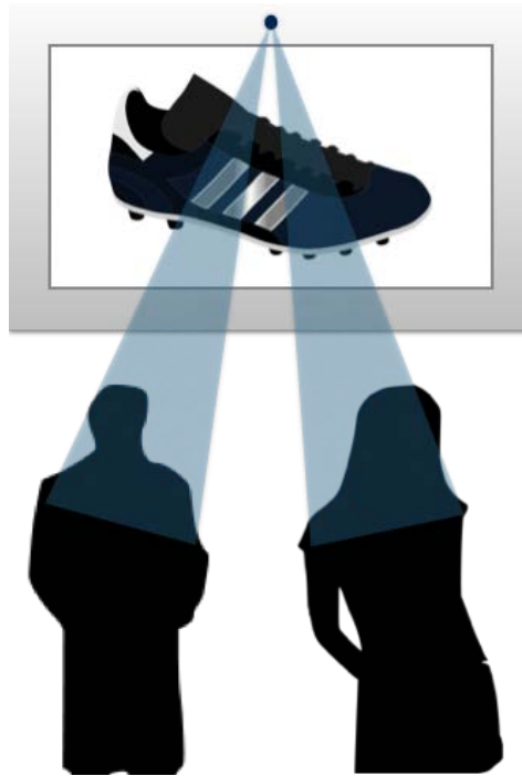
Figure 5: Using soft biometrics, advertising billboards can detect the numbers, genders and age groups of viewers in an area. This helps retailers understand how shoppers are affected by advertising and promotions.

Although the use of biometrics has traditionally been associated with security applications, there are many other circumstances where the automated recognition of individuals is valuable. One commercially important area is in tracking customers while they shop, primarily to help understand their interests, and hence identify ways to sell them more goods and services (Fig. 5). The current technology used for customer tracking in physical spaces is similar to the initial tracking capabilities of web analytics companies, focusing on counting the number of unique visitors and identifying statistics of where customers travel within stores.