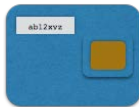
Figure 4: Small portable devices with fingerprint readers can be used to provide time-linked passwords to secure online services.

Bank transactions are increasingly being performed using online applications that enable the monitoring of accounts and the transfer of funds. However, there is a