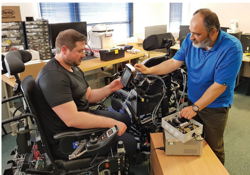
FIGURE 2. The aim of the ADAPT project is to develop affordable technologies that can be added to wheelchairs to give wheelchair users more independence and a better quality of life.

Sirlantzis is looking forward to the widespread deployment of 5G cellular wireless technology. “By increasing the speed of wireless and mobile communication, and reducing latency, 5G technology opens a wide range of possibilities for enhancing the quality of life and well-being of people with disabilities,” he observes. “It can, for example, improve accessibility by providing visual and navigation information about routes, and accessibility options and services available to specific buildings or urban locations,” he notes.