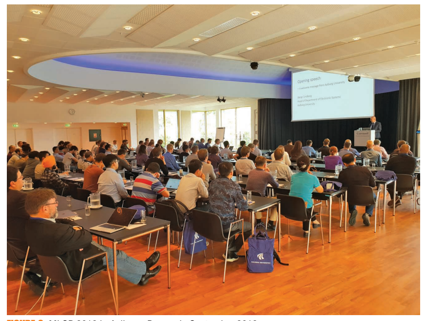
FIGURE 2. MLSP 2018 in Aalborg, Denmark, September 2018.

https://ieeemlsp.cc. Table 1 lists the workshops held in the past several years. Due to the COVID-19 pandemic, MLSP 2020 will be a virtual conference that can only be attended online. MLSP 2021 is planned to take place in Gold Coast, Australia, with Karim Seghouane and Dong Xu as the general chairs. Innovation has always been a key element in the organization process. For example, MLSP 2018 (Figure 2) introduced an