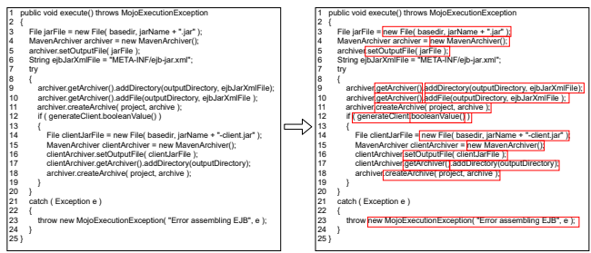
Fig. 2. An example of locating sensitive points.

2) Code Snippets Generation and Labeling: A code snippet consists of a number of semantically related lines of code. As aforementioned, we have implemented two different detectors to generate code snippets, the VulDeePecker detector and SySeVR detector. (1) VulDeePecker detector. For each sensitive point, we trace the backward data flow of corresponding