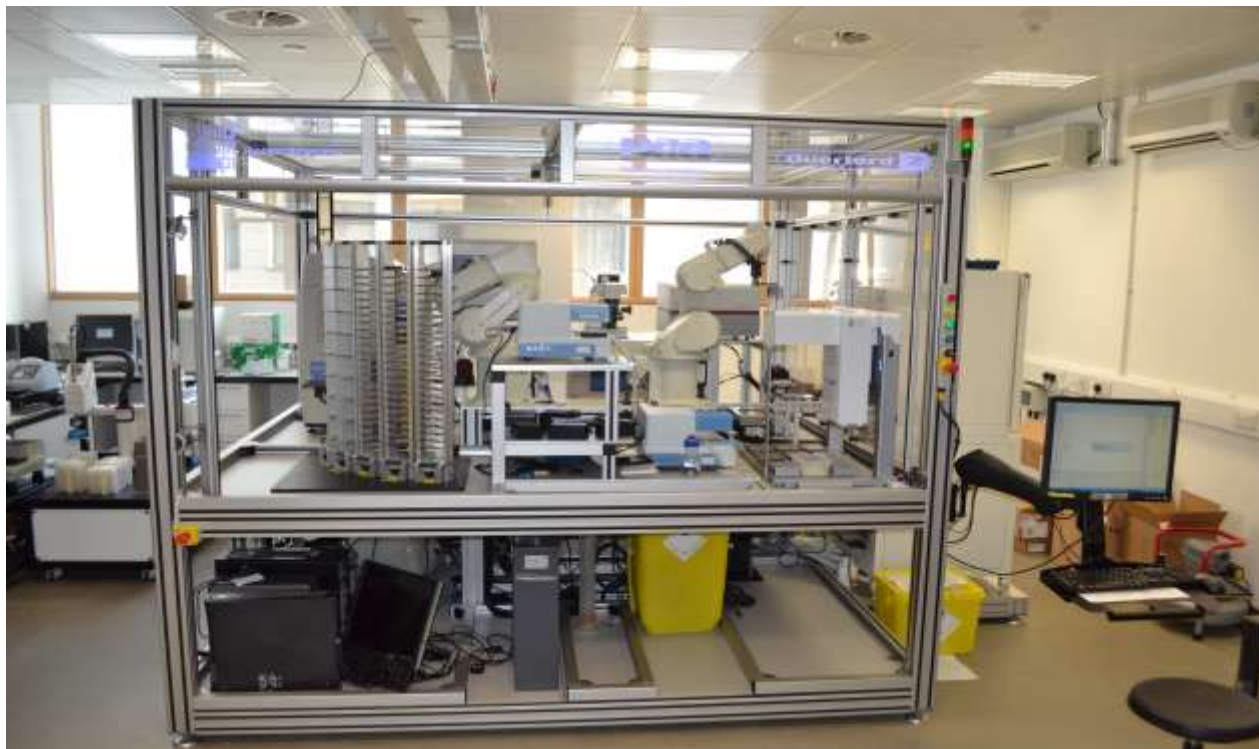
Figure 1. The Robot Scientist 'Eve'.