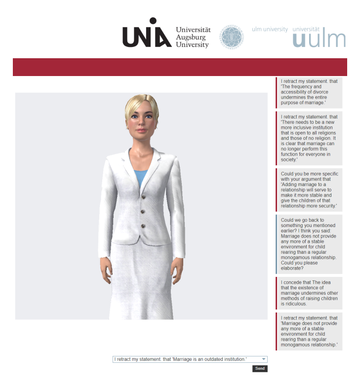
Fig. 3. Screen capture of the EVA interface including a drop-down menu with possible answers, avatar and dialogue history.

Within this work, the focus lies on the emotional response of the user to arguments that are presented to him or her. In order to focus on this aspect only, the user's role in the