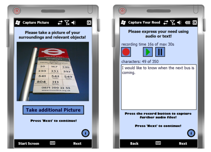
Figure 3. Figure 1 Taking a picture of the environment (left) and documenting a need (right) using iRequire

Documenting a need: This feature of iRequire enables end-users to blog their individual needs and ideas for an envisioned software system. More specifically, iRequire enables end-users to document text-based requirements descriptions (see Figure 3). When using this feature, endusers can document needs such as I would like to know when the next bus is coming. However, studies [42] have shown that using a mobile tool's (virtual) keyboard for entering text is not always comfortable and that audio recording is sometimes the preferred choice. Therefore, iRequire provides a dictaphone-like audio recording feature allowing the quick documentation of upcoming ideas and requirements. To prevent wordy and excessive descriptions of needs, iRequire limits textual descriptions and audio recordings to a maximum number of characters and a maximum time for recordings.