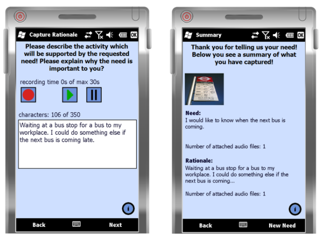
Figure 4. Figure 2 Capturing rationale / supported task (left) and summarizing captured information (right)