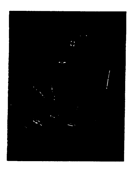
Figure 1: The Marsokhod rover.