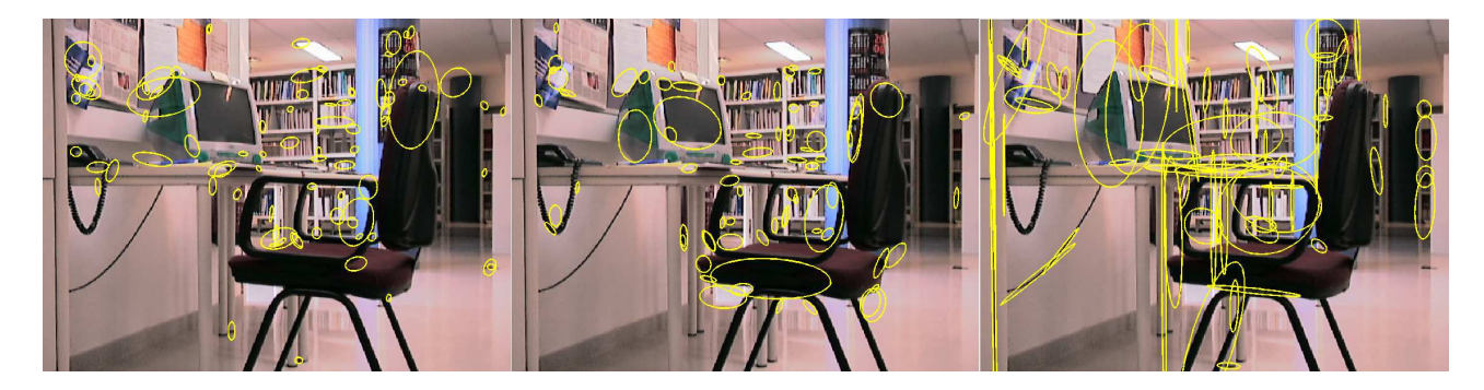
Fig. 1. Example of regions for the three affine covariant region detectors, from left to right: Harris-Affine, Hessian-Affine and MSER.

various state of the art region descriptors [18]. The SIFT descriptor computes a 128 dimensional descriptor vector with the gradient orientations of a detected region. In short, to construct the descriptor vector the SIFT procedure divides the region in 16 rectangular sub-regions and then, for every sub-region, it builds a histogram of 8 bins with the gradient orientations weighted with the gradient magnitude to suppress the flat areas with unstable orientations. The descriptor vector is obtained by concatenating the histograms for every sub-region. The GLOH descriptor is similar to SIFT, with two main differences: the sub-regions are defined in a log-polar way, and the resulting descriptor vector has 272 dimensions but it is later reduced to 128 with a PCA.