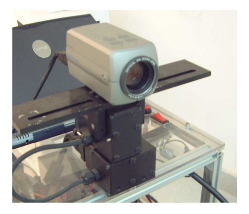
Fig. 3. The camera and pan-tilt unit used to take the images.

The region detectors and descriptors provided by the authors of [12] at http://www.robots.ox.ac.uk/~vgg/research/affine/ were used to extract the affine-covariant regions from the images. To construct the panoramas, the images acquired with the camera are projected to cylindrical coordinates, and then the displacement between each pair of images is computed. To compute the displacements, the same feature points used for localization are used and, if not enough points are detected, a correlation-based approach is employed. This approach finds the displacement where the highest correlation between the edges extracted from the images is achieved. The correlation-based method works well even in the case of very low