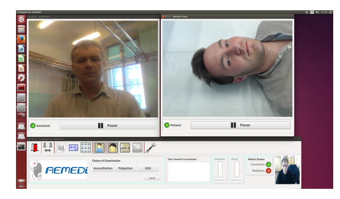
Fig. 3. Graphical user interface for the doctor. It contains two windows for individual communication channels to assistant (left) and patient (right). The third window in the lower part is for displaying additional information and for setting preferences.

Based on the user requirements, we designed an initial graphical user interface (GUI) controlled by mouse and keyboard for the doctor to communicate with assistant and patient. Fig. 3 shows a screenshot of the GUI. We implemented the software as a custom-built package using the libraries GStreamer-0.10 for video and audio streaming, QT4 for the graphical interface, and the ROS framework for peer to peer communication. It consists of three separate windows. The upper two windows contain video channels to the assistant and to the patient. In the third window, which we will refer to as data window , the doctor can access basic functionality of the robot. He/she can also customize system preferences, for example, screen brightness and sound volume of the communication channels.