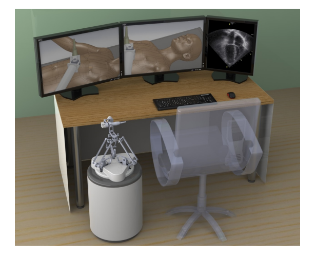
Fig. 1. Visualization of the ReMeDi system at the doctor's location: the doctor has communication interfaces to the patient and the assistant as well as a control console for the remote robot.

One possibility to overcome this problem is tele-medicine. The ReMeDi project (Remote Medical Diagnostician<sup>4</sup>) is developing and building a medical robot that enables doctors to conduct remote examinations of patients. Fig. 1 and Fig. 2 show the two parts of the system. At the doctor's site (Fig. 1), there is a console that contains the interfaces for communication between the doctor's and the patient's sites and control elements to steer the remote robot. The doctor remotely controls the ReMeDi robot at the patient's site (Fig. 2), which is equipped with sensors and end effectors. Alongside the robot, there is a technical assistant that supports the remote doctor with setting up the robot. The ReMeDi robot supports two types of examination: ultrasonography (the doctor examines the internal organs of the patient by moving an ultrasonic probe over the patient's body), and physical examination (the doctor presses the patient's stomach with her/his hands to feel the stiffness of internal organs and to observe the patient's feedback during the procedure).