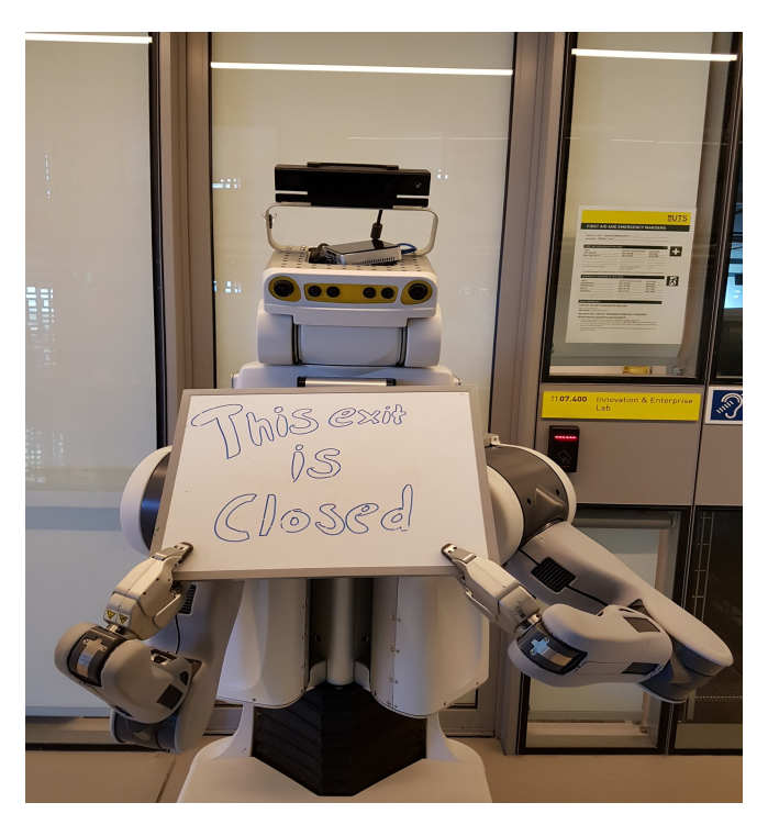
Figure 1. Preliminary experiment behavior