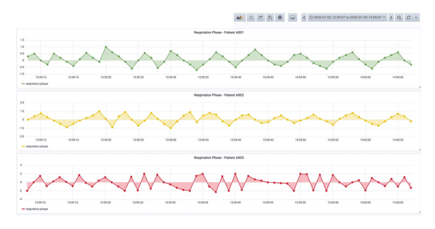
Fig. 3. Grafana example showing respiration rates

Hospitalization may occur when a rapid patient deterioration happens. We propose to treat the hospitalization problem as an evaluation problem for HMM. Given the Hidden Markov Model \lambda = (A, B, \pi) and a sequence of observations O, find the probability of an observation P(O|\lambda) . A cross-validation process also is proposed to be conducted to verify the effectiveness of the model. The following steps are conducted: a) Feature selection: We need to extract the features that may better predict the future patient hospitalization; this process requires a deep study of the signal and segmentation of required sections. Typically the hospitalization occurs when there is exists frequently shortness of breath; then the quantities of shortness of breath and time periods need to be used to feed the model; b) Training procedure: The training procedure, based on the Expectation-Maximisation algorithm, set all the transition and the emission probabilities in order to maximise the probability of generating the sequences of the training set. The trained HMM is able to compute the probability of generating any new sequence; c) Testing: We also propose to apply the HMM process on test sequences to actually predict the hospitalization rates. d) Evaluation: a cross-validation process will be used to evaluate the performance of the patient hospitalization prediction.