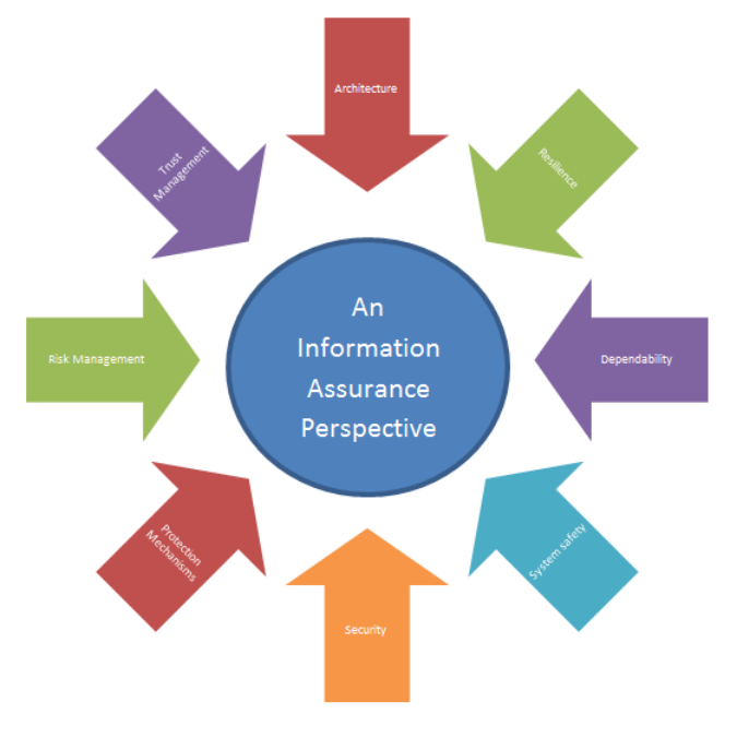
Figure 1: Dynamic Attributes of Information Assurance

There is a plethora of regulatory compliance requirements in place to try to protect digital businesses and their customers. However, being merely compliant is no longer sufficient; cyber resilience posture must be adopted in order to ensure success when operating a hyperconnected enterprise [5]. In order to survive and ensure longevity, these businesses must be constantly evolving, being able to quickly adapt and/or react to the ever changing landscape and have the ability to recover rapidly from unforeseen events.