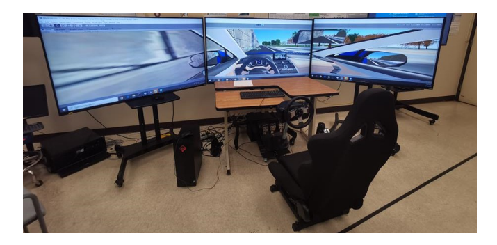
Fig. 4. Human-in-the-loop simulator at the University of California, Riverside.

the proposed algorithm's performance, and the results and analysis of the experiments.