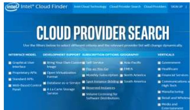
Figure 2. Intel Cloud Finder

The Detailed Search tool gives more flexibility to the users. Users are presented with six main parameters, each of which has sub-parameters that contain features users might find them important. Users can specify rating for a particular feature as "Essential", "Desirable", "Future" or "N/A". Users also have the option of prioritizing one feature over another. Based on the search criteria results provided by the tool gives some sort of ranking to the cloud providers depending on the importance of the features the user has selected.