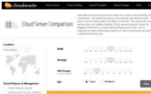
Figure 4. CLOUDORADO

Cloudorado: As shown in Figure 4, Cloudorado divides the Cloud Computing into three categories; Cloud Server, Cloud Hosting and Cloud Storage. It has also a dedicated page that presents list of cloud providers, their offered features and parameters in a tabular form. Cloudorado performs similar to quick search of Intel Cloud Finder, but unlike Intel it does not offer advanced search. Users can select the parameters that satisfy their requirements and a dynamic list is produced based on the user requirements. Cloudorado offers brief description of the parameter in the form of a Tooltip. The result is sorted by price with the lowest cost displayed near to the top. Compared to RankCloudz and Intel Cloud Finder, Cloudorado does not produce a comprehensive result. It only offers users link to the Cloud Provider's website.