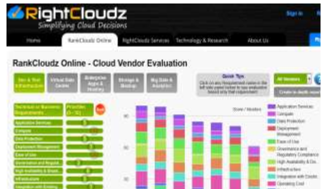
Figure 3. RankCloudz

RankCloudz: Similar to Intel Cloud Finder's detailed search, RankCloudz allows users to give importance to a particular feature by setting its priority. As shown in Figure 3, RankCloudz divides the Cloud Computing platforms into five different scenarios: Dev & Test Infrastructure, Virtual Data Center, Enterprise Apps & Hosting, Storage & Backup and Big Data & Analytics. Each of the categories has their own parameters and user can configure their priority. Priority is assigned on scale from 0 to 10, where 0 is the lowest and 10 is the highest priority. RankCloudz ranks the cloud providers