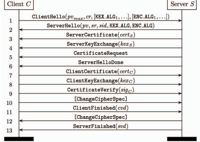
Fig. 1. The TLS Handshake

Concretely, to attack x.com , the man-in-the-middle takes any HTTP request for any server and redirects it to a page on x.com that returns a parameter-dependent Location header followed by the Strict-Transport-Security header. We successfully tested the attack on Chrome, Opera, and Safari. We further note that by using this attack first, a network