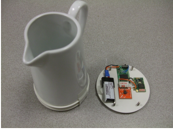
Fig. 1. A jug fitted with a CogWatch Instrumented Coaster (CIC) and an ‘open’ CIC, showing the accelerometer, PIC, Bluetooth module and battery

Its function is to respond to changes in motion, tilting, and disturbances of the object due to the addition of materials, stirring, collisions or (in the kettle) vibration during boiling. The FSRs can detect whether the object is standing on a surface of lifted in the air, changes in weight due to the addition or removal of materials, and more subtle changes in weight distribution across the base of the object (making it possible, for example, to detect stirring). The output of an individual CIC at any time is a six dimensional vector, comprising x, y, z accelerometer outputs plus the outputs of the three FSRs. The data from the FSRs attached to the mug show the increase in weight of the mug as it is filled. The data from the kettle FSRs identifies the points where the kettle is lifted from and then returned to the table. In addition to outputs from CICs, the system uses hand-coordinate data captured using Kinect [18], using software based on the ‘Kinect-Arms’ libraries [19].