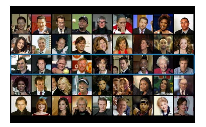
Fig. 1. The previously proposed alternative authentication mechanism, Tetrad. The mechanism was initially designed and targeted for display in a shared-space [12], e.g. television in a living room.

Therefore, any alternative authentication scheme also encounters the challenge of scaling between devices. Passwords have demonstrated an ability to scale between traditional computers, such as desktops and laptops, and more mobile devices, such as smartphones and tablets. This suggests that any alternative authentication solution seeking adoption would either need to demonstrate convincing performance in switching between devices or, at least, outline how solutions would perform when authentication occurs on a non-target device.