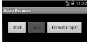
Fig. 2: Code snippets and graphical interface of the Recorder app

1 public class Recorder extends Activity { 2 private MediaRecorder recorder = null; 3 .... 4 public void onCreate(...) { 5 ((Button) findViewById(R.id.start)) 6 .setOnClickListener(startClick); 7 .... 8 // startRecording(); 9 } 10 11 private void startRecording() { 12 recorder = new MediaRecorder(); 13 recorder.setAudioSource 14 (MediaRecorder.AudioSource.MIC); 15 recorder.setOutputFile(/* file name */); 16 .... 17 recorder.start(); 18 } 19 20 private View.OnClickListener startClick 21 = new View.OnClickListener() { 22 public void onClick(View v) { 23 .... 24 startRecording(); 25 } 26 .... 27 }