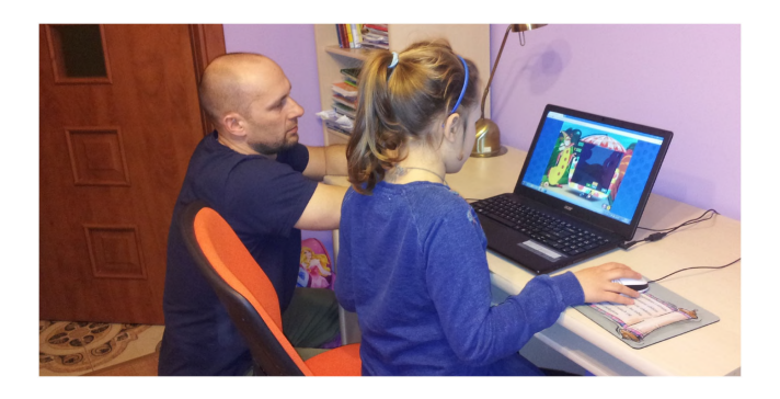
Fig. 3. Adult–child cooperative playing: A session when a child and her parent are cooperatively playing with the ASC-Inclusion platform. Parents role was to build pleasant cooperative parent–child playtime at home with the software.

Focusing on previous works with parents of children with ASC, a series of user studies have been carried out, in order to define the requirements and the technology adjustments which can enable the adult–child cooperative play [24]. In fact, psychological experiments and evaluation with recruited adults-parents and children (cf. Fig. 3) were conducted in Poland. During the period of the trial, the researchers were periodically monitoring the parents once a week to check on any queries. Parents were also encouraged to contact the research team with any questions or if any technical aspect of the program needed adjustment. The psychological experiments were carried out with 40 parents recruited in Poland. A preliminary study was conducted with a number of games in the ASC-Inclusion platform with the aim of defining requirements and specifications for the program. A